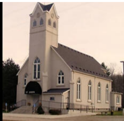
+ ST. JOSEPH STRINGTOWN