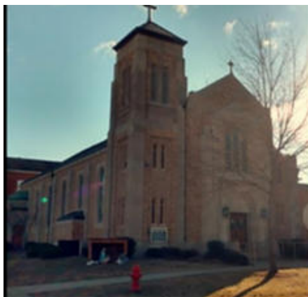
+ ST. JOSEPH OLNEY