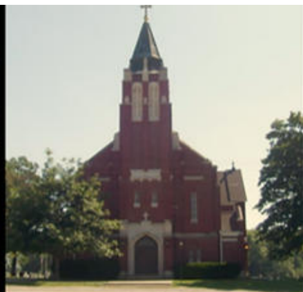
+ HOLY CROSS WENDELIN