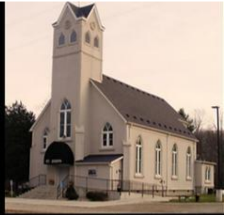
✚ ST. JOSEPH STRINGTOWN