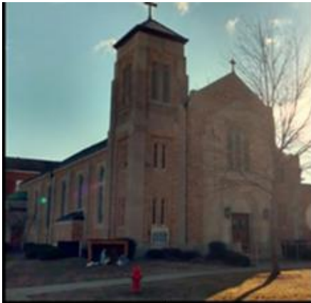
✚ ST. JOSEPH OLNEY